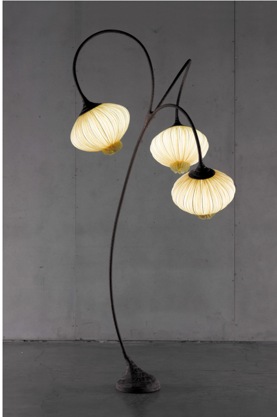
Palm Tree Designed by Aqua Creations