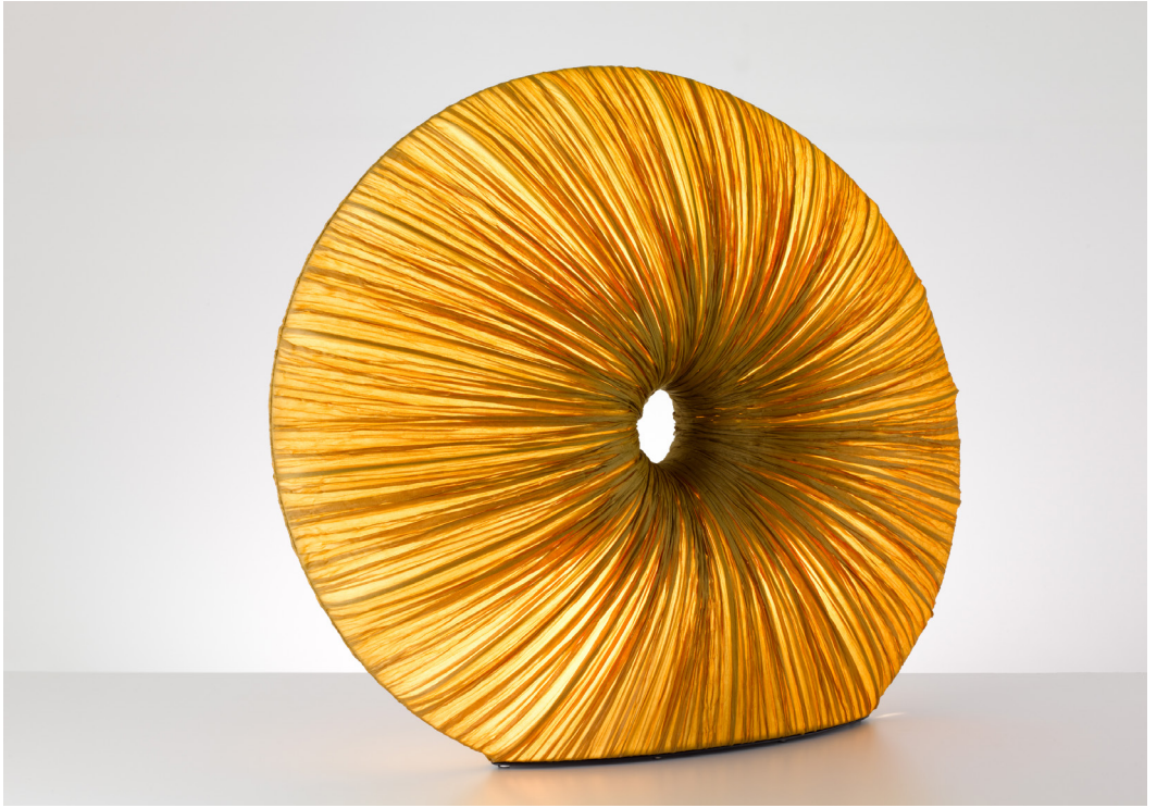
Rigua Designed by Aqua Creations