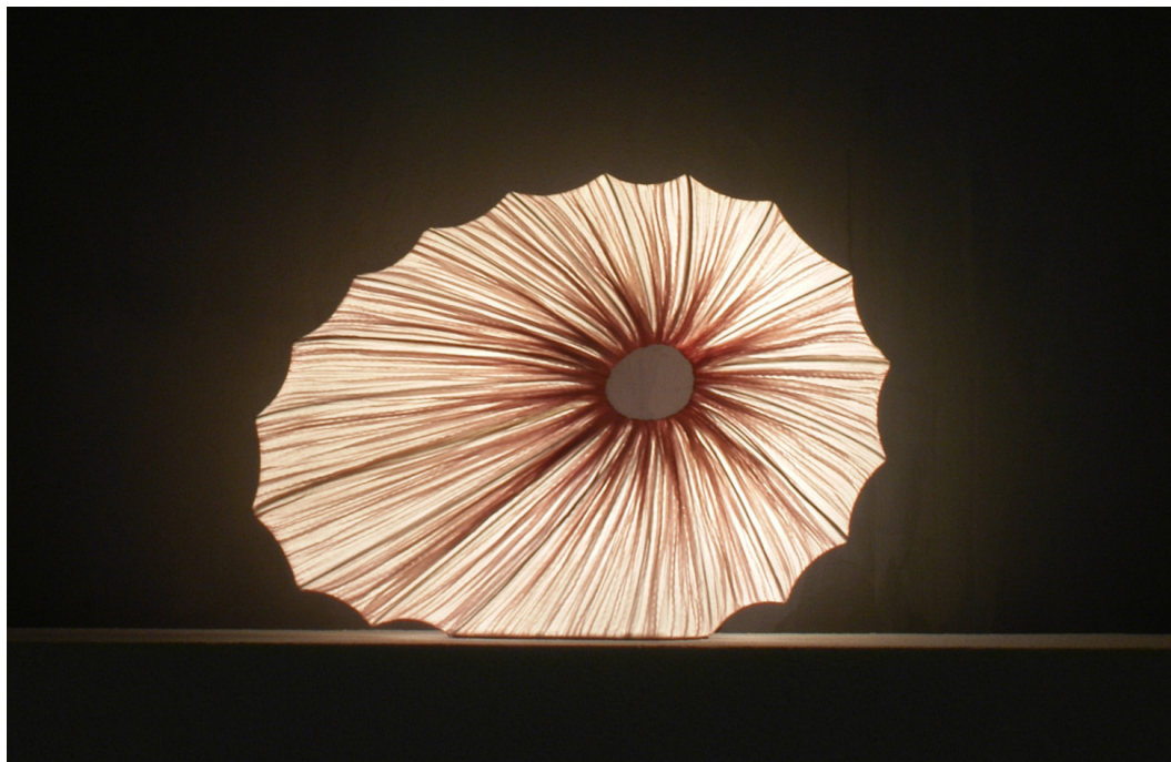
Viola Designed by Aqua Creations